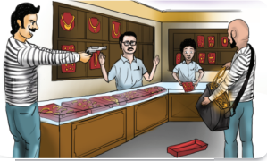
ROBBERY (DAY & NIGHT)

Protect your shop with 'Jewellers Block Policy' from Government & Private Insurance Companies