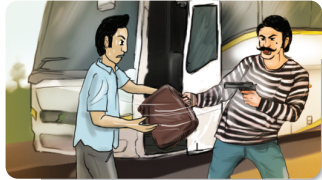
TRANSIT RISK (ALL OVER INDIA)